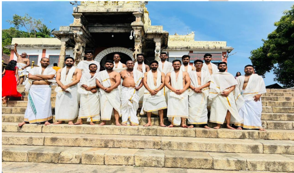
Pic- Visit to Padamanabhswamy Temple in traditional attire

The temple is located in the East fort of Trivandrum. After entering east fort, there is pond, padmatheertham on the right hand side of the path and Kuthirmalika Palace on left hand side of the path. The temple is built in an intricate fusion of the Kerala style and the Dravidian style of architecture, featuring high walls and a 16 th century gopuram. The gopuram of temple is 100 foot (30 m) high, it has 7-tier and it is built in pandyan style . The temple has 4 entrance- kizakke nada , padinjare nada , vadake nada and thekke nada " (means East, West, North & South). As it was Sunday, the temple had a lot of rush and the queue was very long. The queue runs through the corridor and then into the sanctum sanctorum. In the Grabhagriha , Padmanabha reclines on the serpent. The deity is visible through three doors – the visage of the reclining Padmanabha and Siva Linga underneath his hand is seen through the first door; Sridevi and Bhriгу Muni in Katusarkara, Brahma seated on a lotus emanating from the deity's navel, hence the name, " Padmanabha ", gold abhisheka moorthies of Padmanabha, Sridevi and Bhudevi, and silver utsava moorthi of Padmanabha through the second door; the deity's feet, and Bhudevi and Markandeya Muni in Katusarkara through the third door. After having darshan we went to our buses. The time was around 1pm and we proceeded towards our hotel.