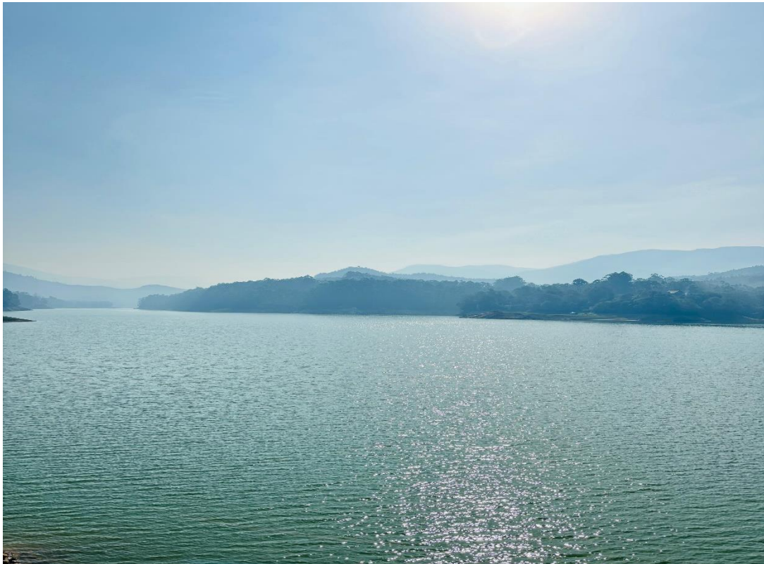
Pic- Mattupetty lake

In the morning we visited Mattupetty dam. Mattupetty is more than just a water storage facility. The water body that forms as a result of this gravity dam is often termed as Mattupetty lake.