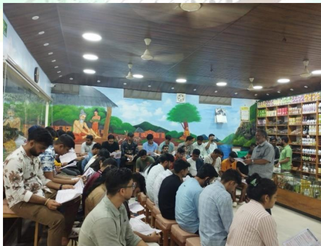
Pic- Learning about spices and ayurvedic medicines

ii. From Periyar tiger reserve, we proceeded to our next destination Munnar and reached there by 11pm. On the way from Thekkady to Munnar we witnessed many tea, spice and rubber plantations at Spice garden and getting to know about various ayurvedic plants used for treatment of different kind of diseases.