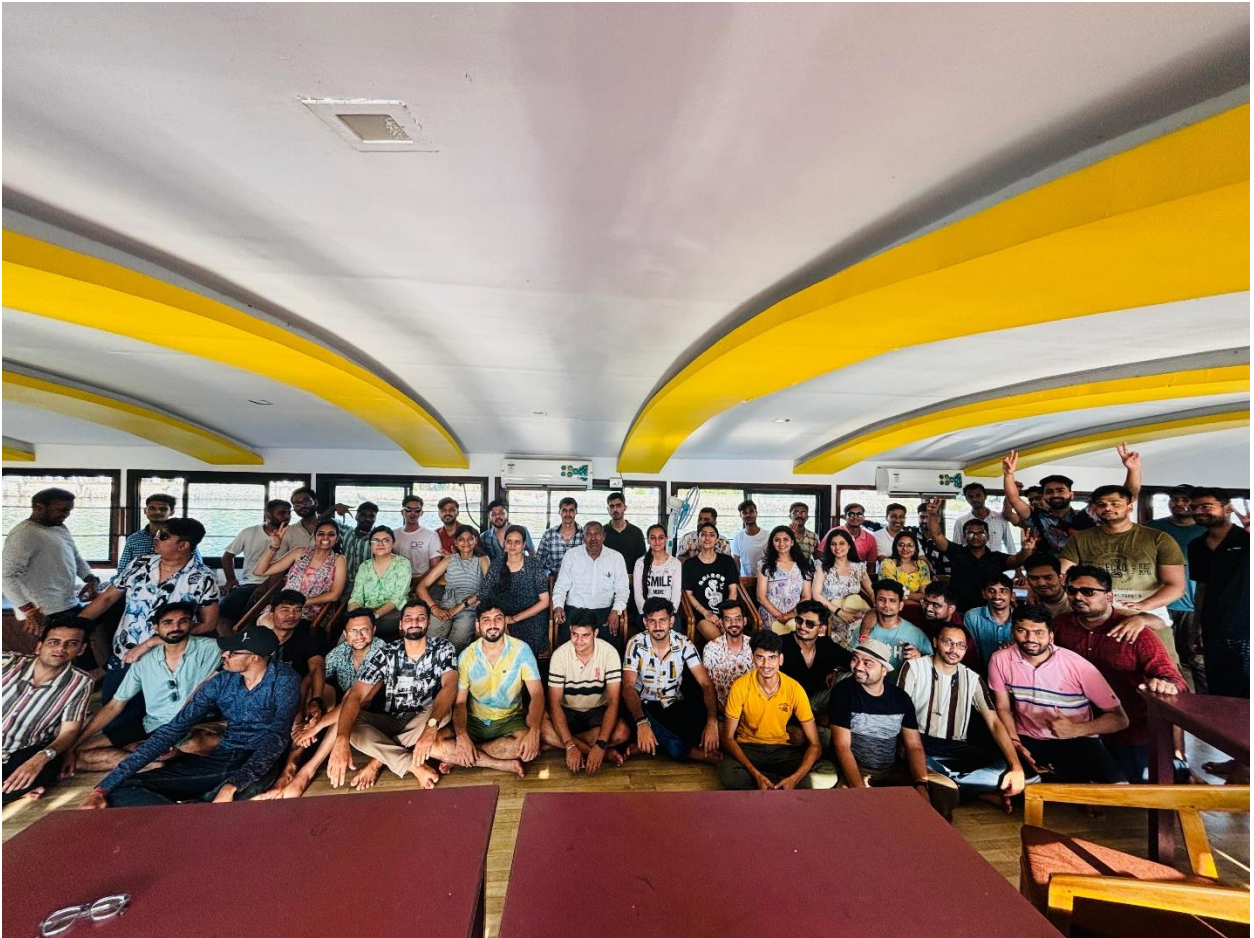
Pic- Group photo in cruise boat in Alleppet Backwaters

The economy of Alleppey is based on paddy farming, tourism and coir industry. Alleppey is part of Kuttanad region, this region has the lowest altitude in India, and is one of the few places in the world where farming is carried on around 1.2 to 3.0 meters below sea level. The region is known as the rice bowl of Kerala and it is also the part of second largest Ramsar site in India. To stop the saltwater intrusion into the Kuttanad, a 1252m long saltwater barrier, Thanneermukkom has been built on Vembanad lake.