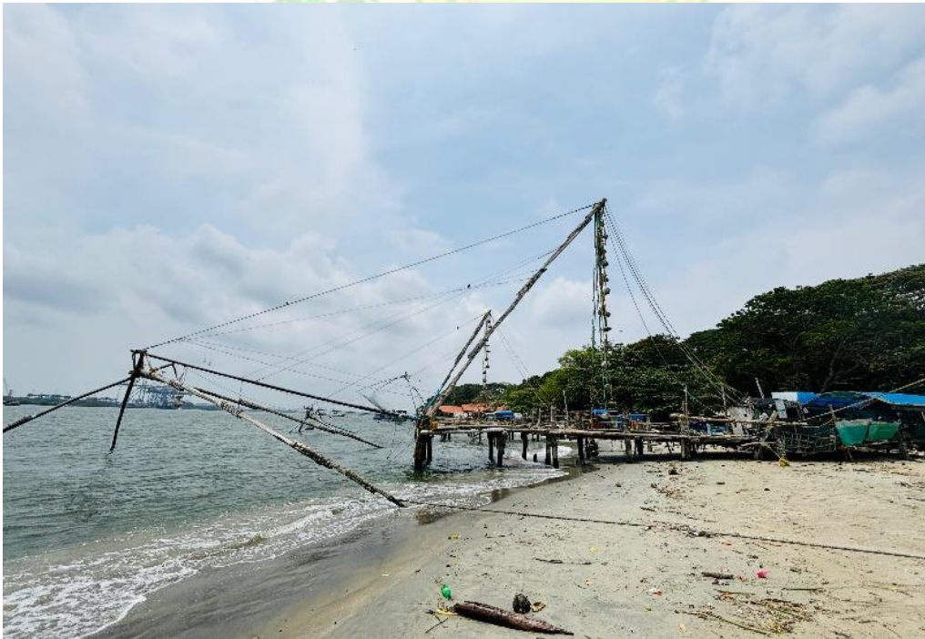
Pic- Chinese Fishing Nets