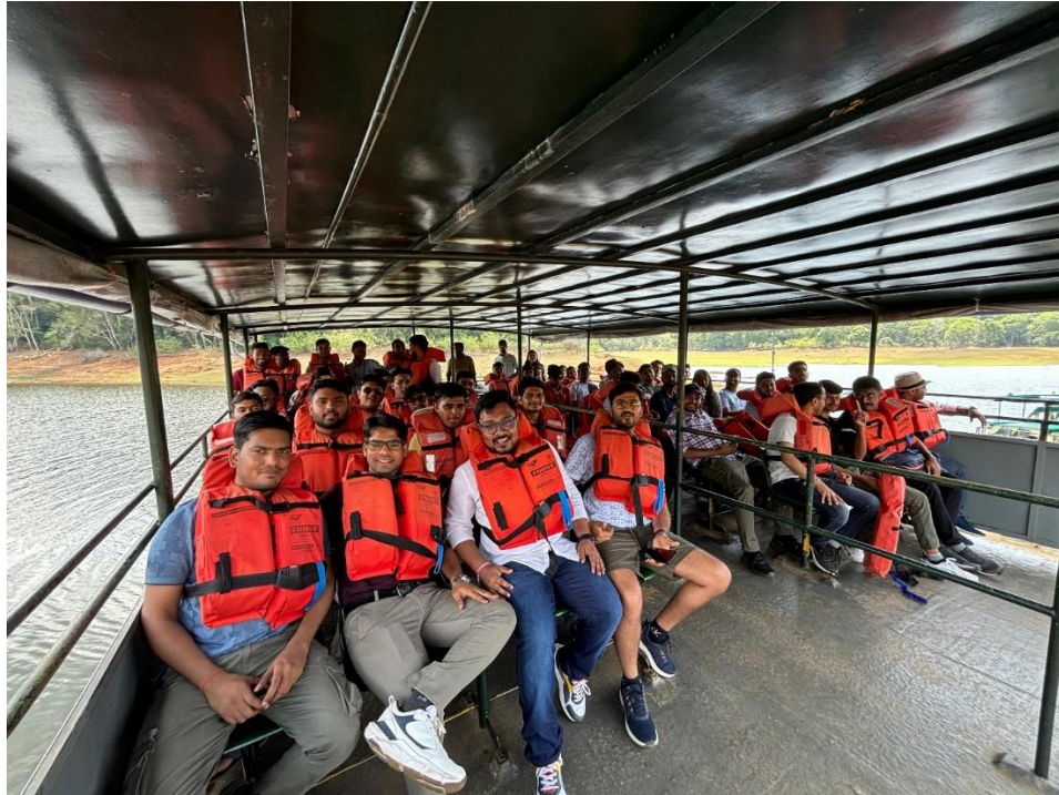
Pic:-Boating in Periyar Tiger Reserve

ii. From Periyar tiger reserve, we proceeded to our next destination Munnar and reached there by 11pm. On the way from Thekkady to Munnar we witnessed many tea, spice and rubber plantations at Spice garden and getting to know about various ayurvedic plants used for treatment of different kind of diseases.