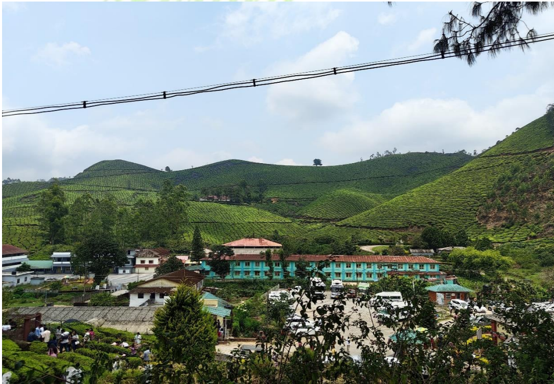
Tea estate, Munnar

Tea has played an integral part in the history of Munnar. Tata tea museum has photographs and machineries, which chronicle the journey of tea in the area. The museum set up at the Nallathanni Estate of Tata Tea ensures that the legacy of those who worked hard to ensure the tea plantations survived this long is recognised publicly. We got to watch the transition from the rudimentary tea roller to the modern fully automated tea factory. Various stages of tea processing can be seen, which includes the making of black tea. There was a sundial, placed on a granite block, which was made in 1913 by the Art Industrial School at Nazareth, Tamil Nadu. We tasted some of the most exotic varieties of tea available around the world here.