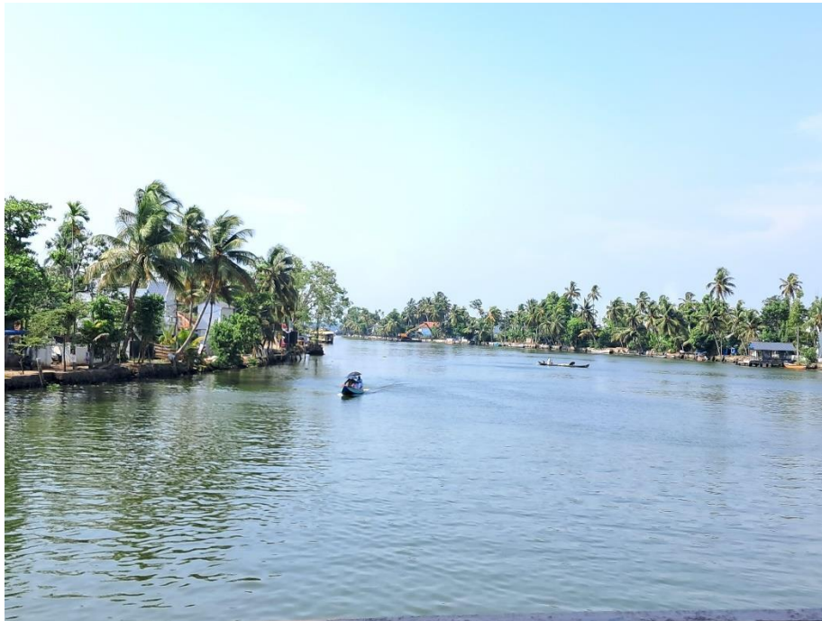
Pic- Alleppey Backwaters

At around 9am we departed from Trivandrum to Alleppey. We reached our destination at 2pm. Alleppey is famous for its canals, backwaters, beaches and lagoons. We had booked a backwater cruise to see the scenic man made islands and beautiful sights of coconut fringed backwaters and paddy fields. All the staff of the cruise boat was local and they acted as our guide for the backwaters journey. The cruise started from Pamba river and went upto Vembanad lake.