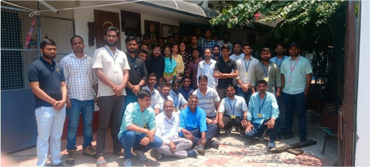
Pic- Visit to Theruvoram NGO