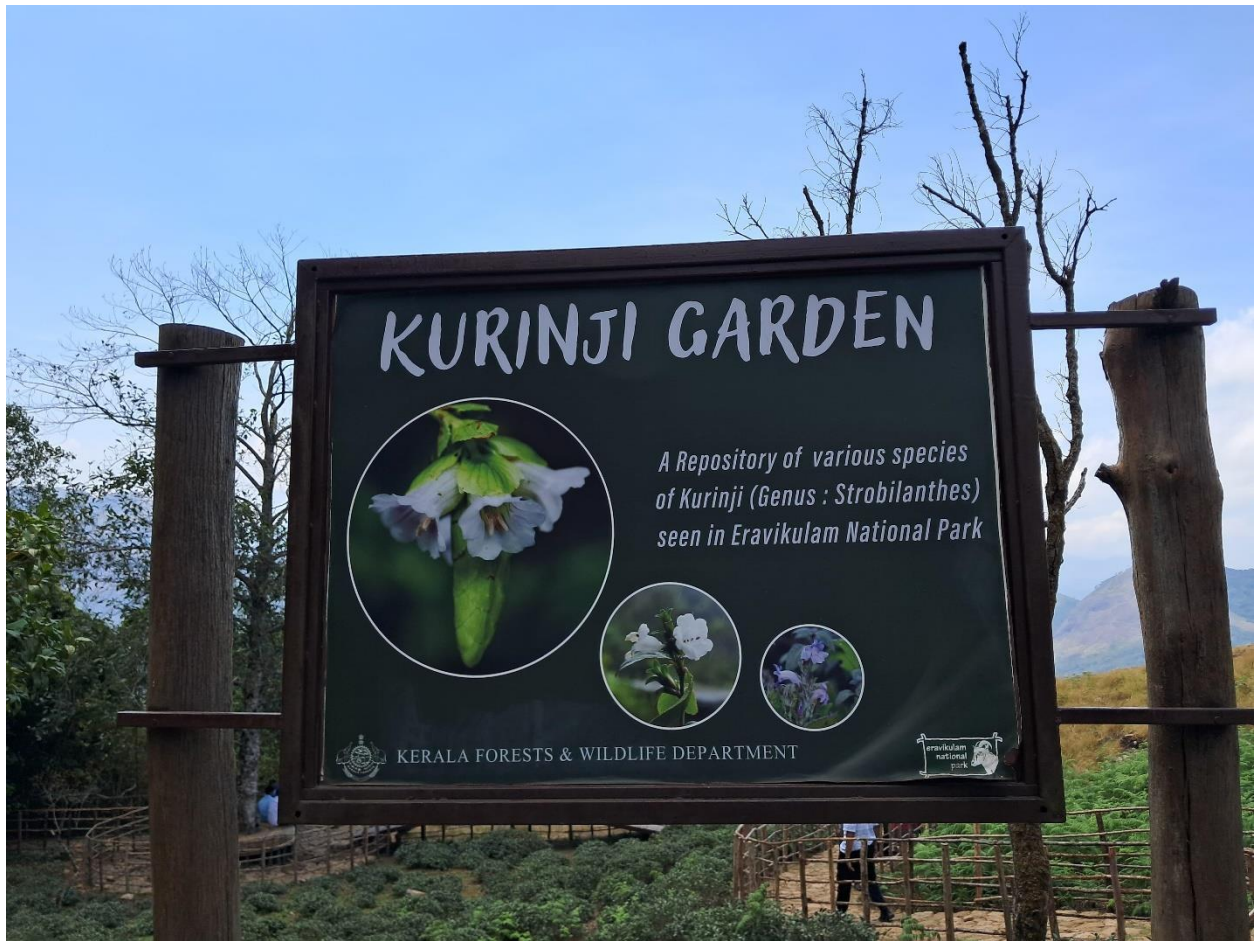
Pic- Kurunji Garden

Neelakurinji is an endemic species of Western Ghats and it is under threat because of being plundered from the grasslands of High Ranges by ignorant/berserk people. It blooms once in 12 years. It last bloom in 2018 and hence it will bloom again in 2030. After spending some time on the top, we came back to the starting point of the trek and visited “story of the park”. it shows brief history of the park and the flora and fauna which are found in the park with special attention to niligiri tahr.