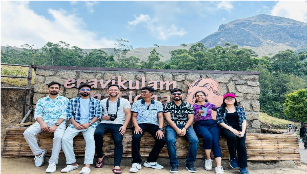
Pic- Eravikulam National Park

In the morning we departed for Eravikulam national park which was 15km from our hotel. It is situated in the Kannan Devan Hills of the southern western Ghats. The wildlife park has an area of 97 sq. km. and it is the first national park in Kerala.