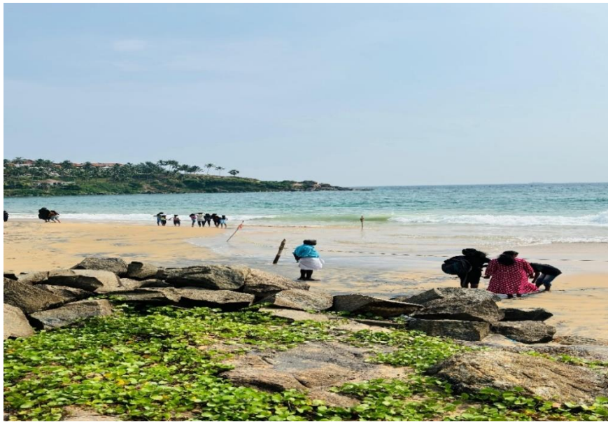
Pic- Mesmerising view of Kovalam beach

In the early morning we went to Kovalam beach to see sunrise. There we had the opportunity to meet some local fisherman. Fishing is one of the major business in Kerala. The catch consists of King Fish, Red Snappers, Pomfrets, shrimps, etc. They sell their lot mostly to local market Here are some glimpse of the Kovalam beach that we captured