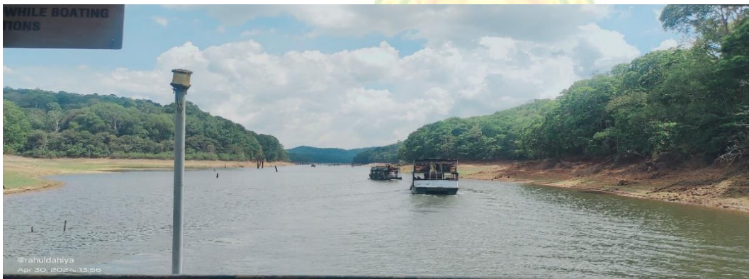
Pic- Periyar Lake

i. At around 8am we proceeded towards Thekkady to visit Periyar National Park. People-oriented and park-centred community-based ecotourism is the hallmark of Periyar Tiger Reserve. These programmes are conducted by local people responsible for the surveillance of the vulnerable parts of the reserve. Community-based and protection-oriented ecotourism programmes (CBET) were initiated in PTR during the IEDP. These programmes were developed to ensure livelihood security and to reduce negative dependency on forests. Tickets for boating at Periyar lake were already booked by us. On reaching Thekkady, a bus of national park took us from our stop to Periyar National Park. There were 4 double decker boats waiting for the tourists at the lake. The boat journey was of 1 hour and during this boat journey we witnessed herd of deer, elephants, wild goats and wild buffaloes. There was no sight of tiger. On inquiring forest official about this, he said that it is a rare sight and in his 24 years of service, he has witnessed tiger only 12 times.